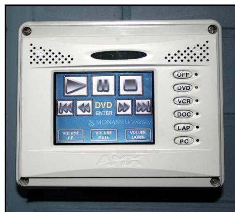
Wall Controller layout (below)