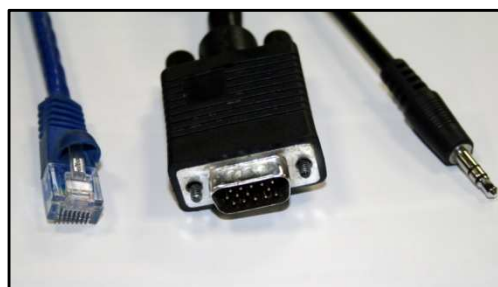
Connectors for laptop (above) Typical lectern touch screen (below)